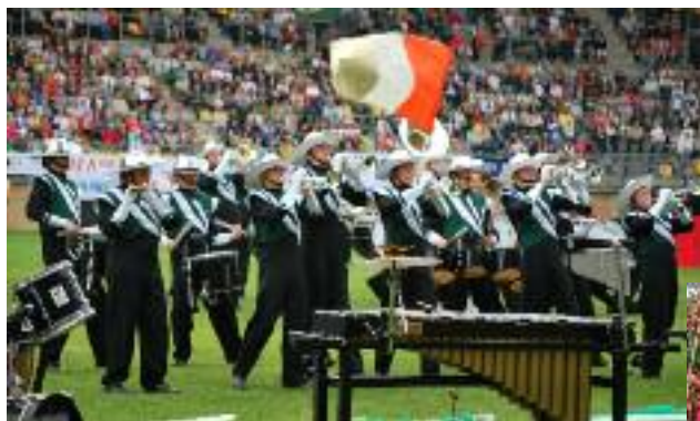
Trinity Show Band competition performance in Kerkrade Holland

The Beeston and District Civic Society celebrated National Tree Week by obtaining a Grassroots grant to fund the planting of trees in each of the local primary schools. The school children were involved in the selection and planting of the trees and will also be involved with maintenance and fruit collection to continue their interest in the project.