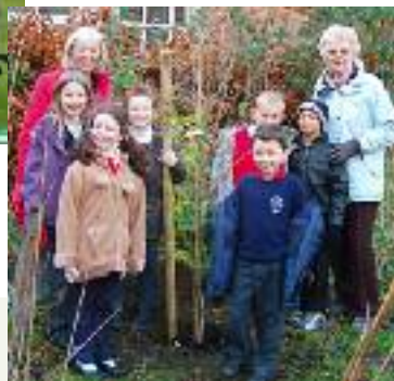
Members of the Group and Young people planting trees as part of the programme