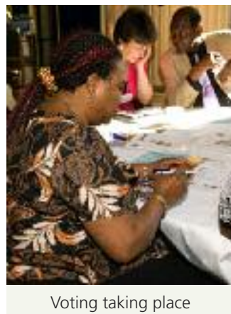
Voting taking place