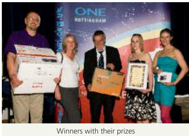
Winners with their prizes

The winners were Access 4 All (Disability Access), Jigsaw Youth Club (Club for young people with Aspergers Syndrome) and Harmless (Self harm support group).